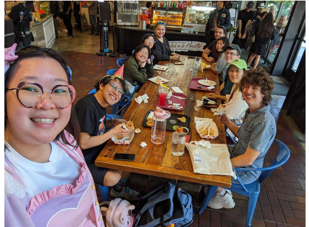
Princeton Club of Northern California