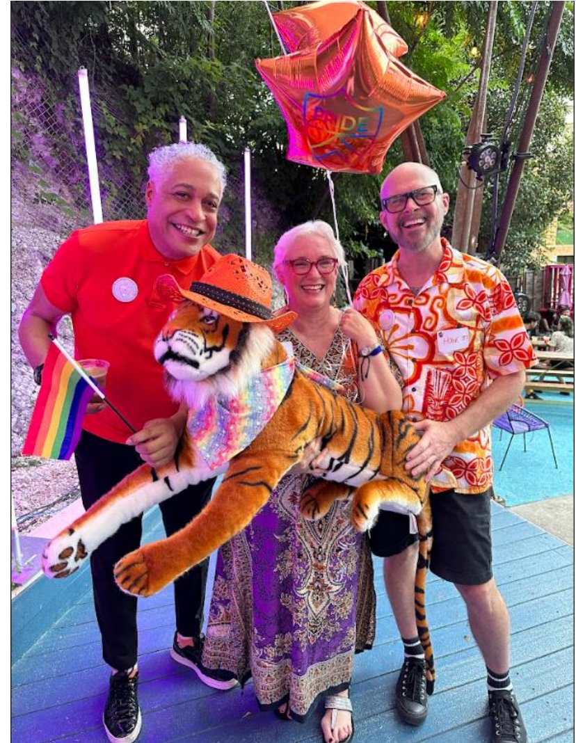
Princeton Club of Austin CPP event, June 2023

Regional Affairs Team at acra@princeton.edu